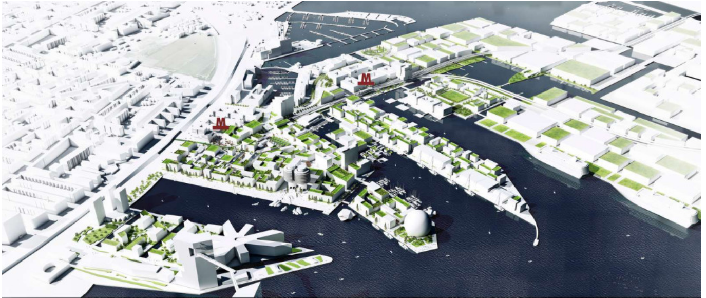
Visualisation of Inner Nordhavn.

The small scale is the reason for the area's success yet at the same time this is what creates the biggest challenge. Because although you can't see it, what takes place above ground has a large impact on what happens underground. Narrow streets and alleys, trees and plants and not least canals all need to be taken into consideration, which doesn't leave much room for supply networks.