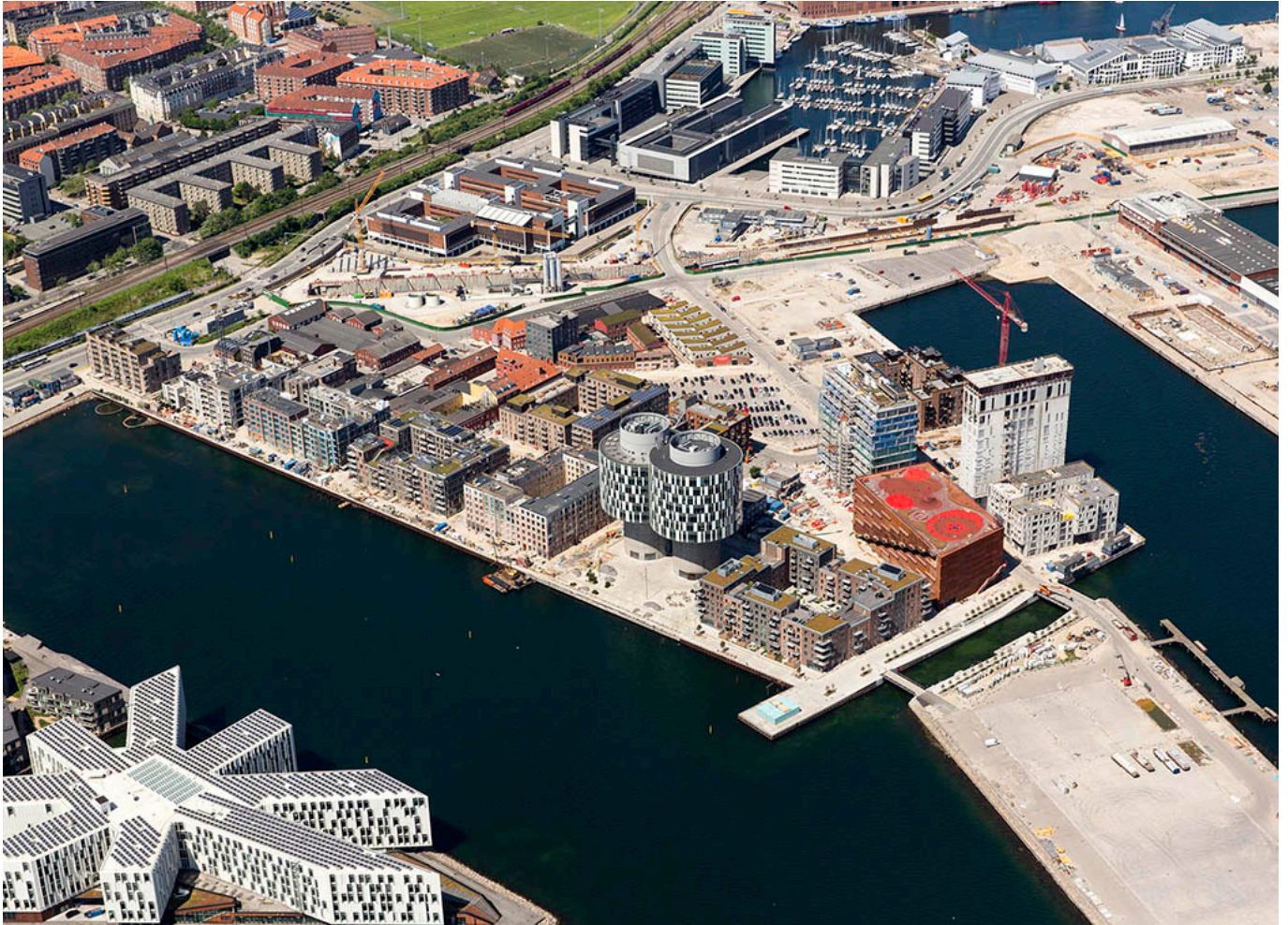
Aerial photo of Århusgade neighbourhood, 2016.