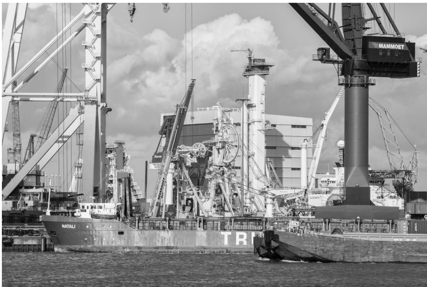
Wiltonhaven, view from the south bank of Neue Maas, Vijfsluizen – Schiedam.