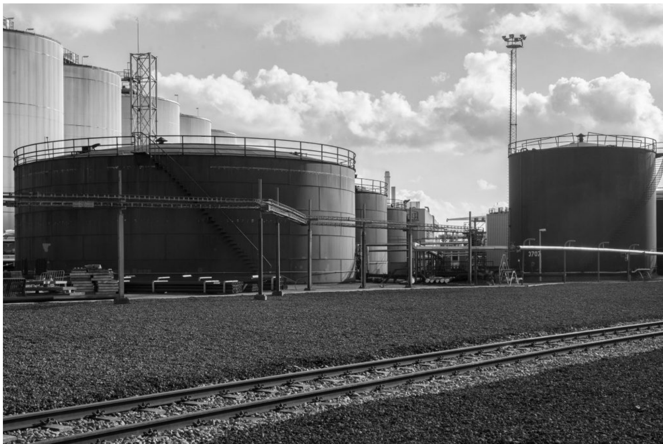
Oil terminal, Vlaardingen.