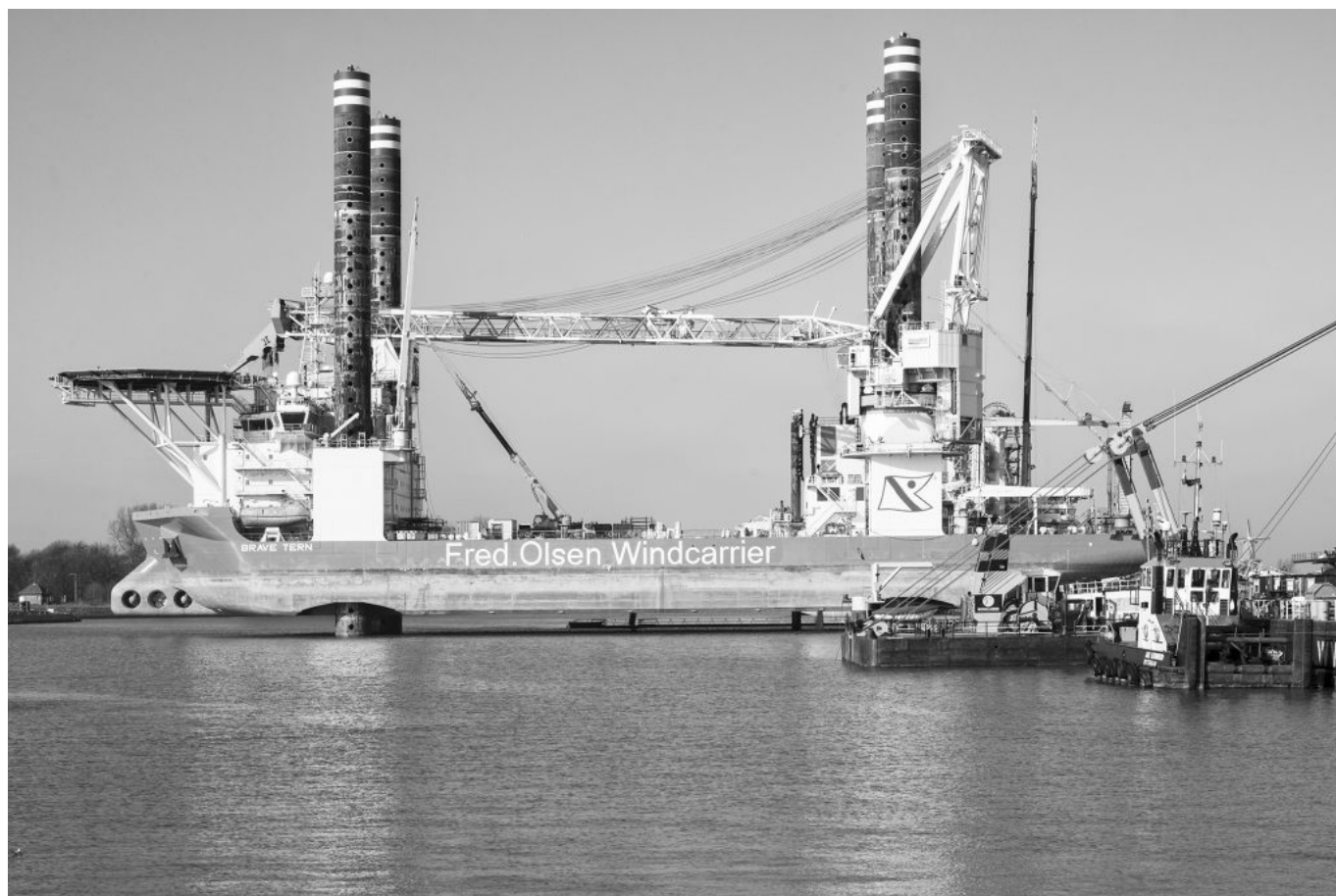
Wind Farm Installation Vessel at Waalhaven, Rotterdam.