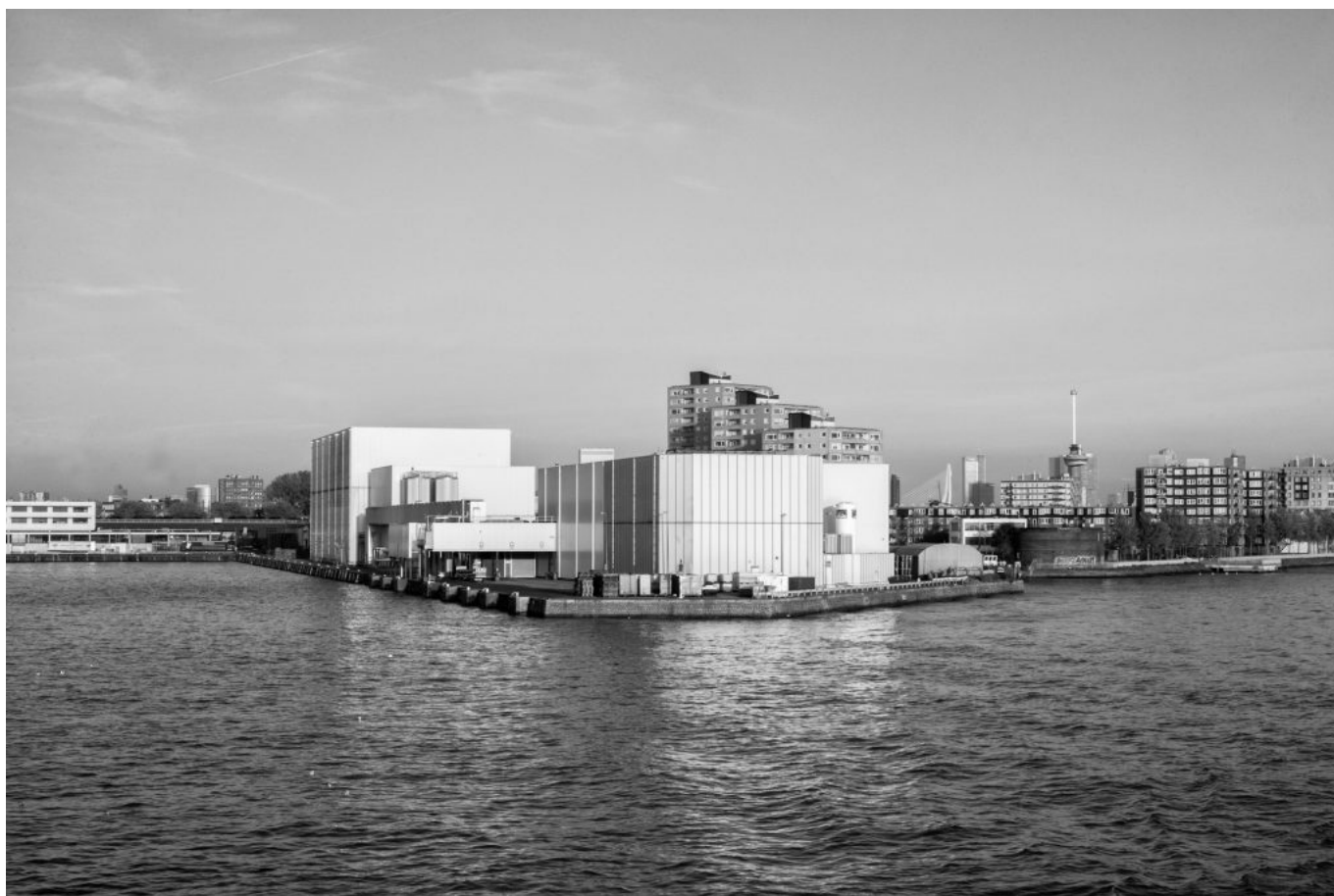
Continental juice terminal, Ljsselhaven, Rotterdam.