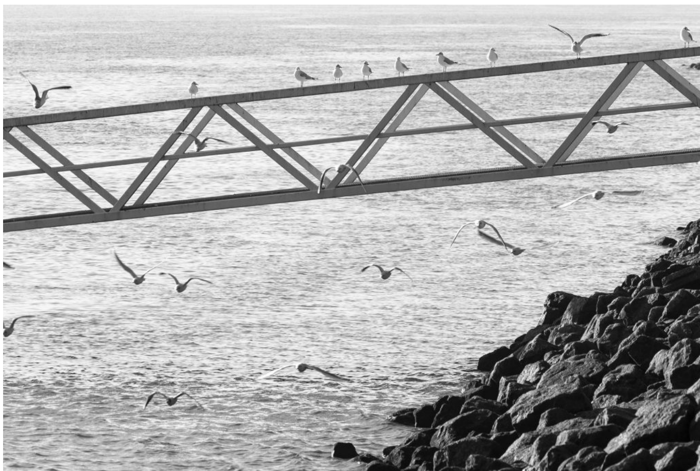
Water taxi pier ramp in the Maas.