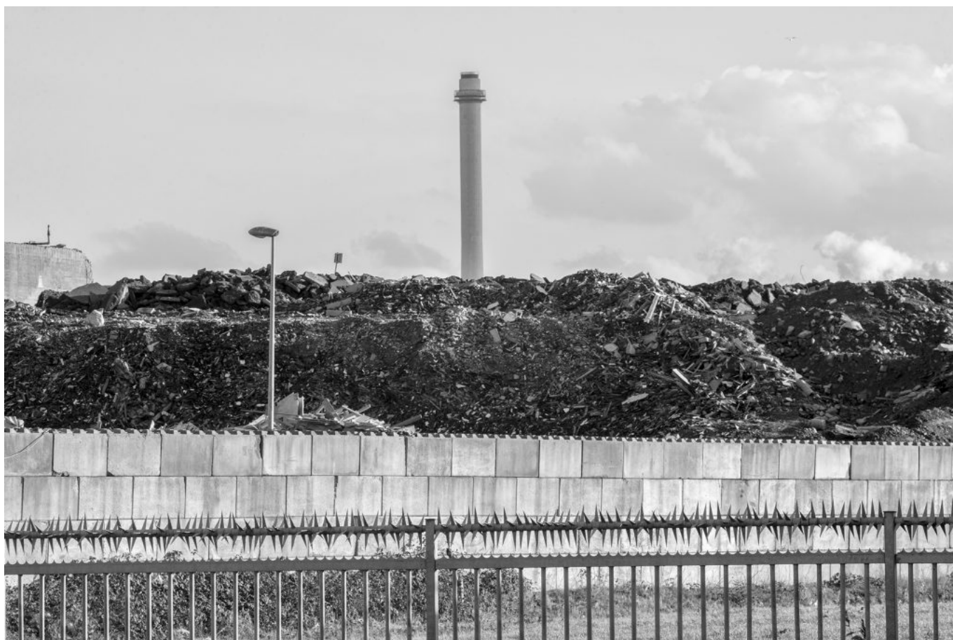
Waste materials storage, Vlaardigen.