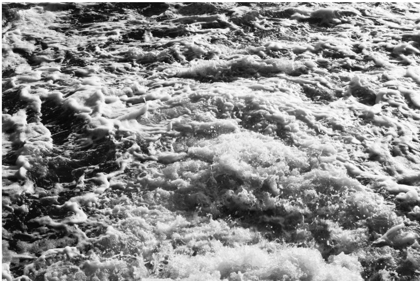
Water, Maasluis.