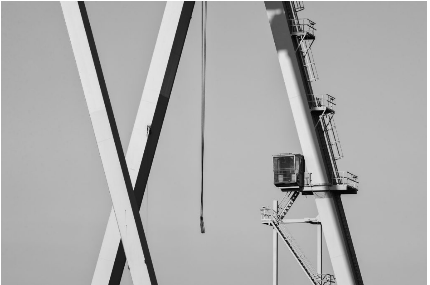
Cranes in Charlois Doklaan, Rotterdam.

I strongly believe that several location within the Port are exceptional attraction, well known by locals, but still unknown from a touristic point of view. Rotterdam and the other municipalities that host and are crossed by the port could embody even more this identity of Port-territory and unfold this potential of industrial tourism.