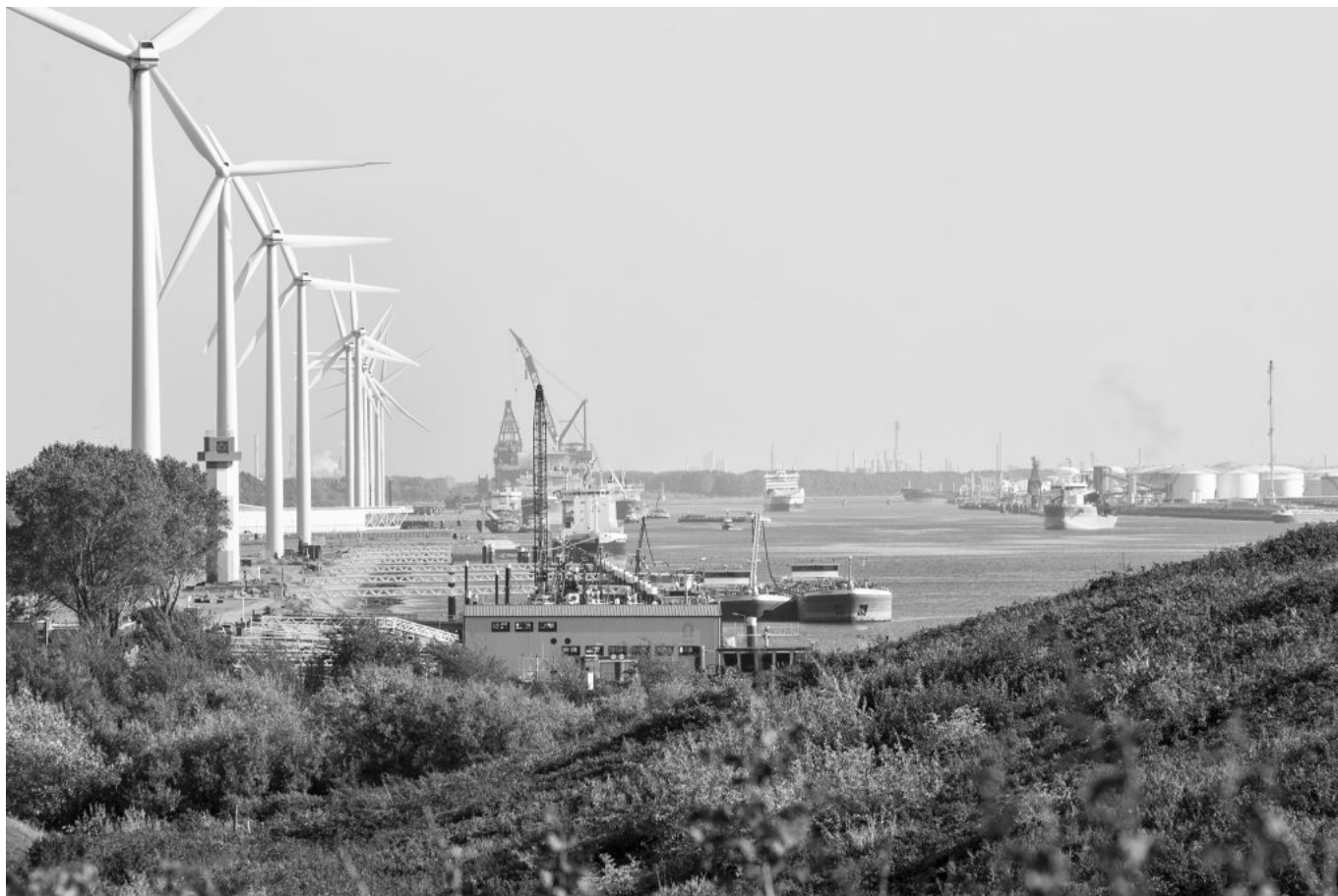
Landtong and Calandkanaal.