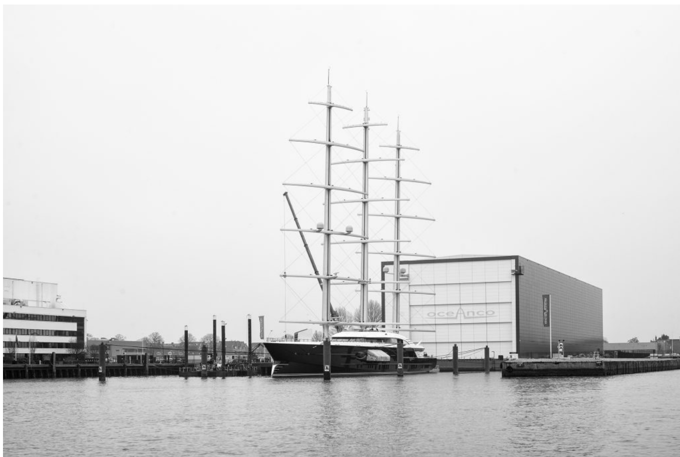
Shipyard in Marineweg, Alblasterdam.