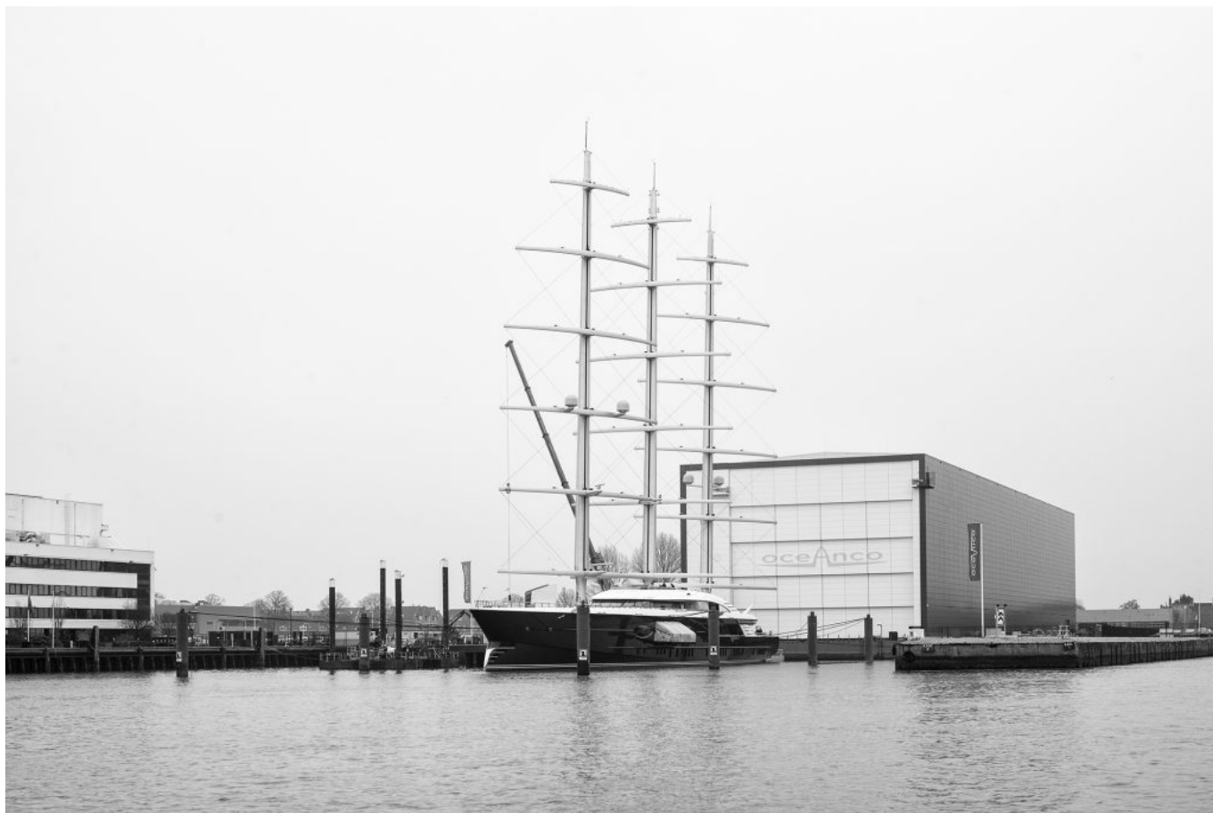
Shipyard in Marineweg, Alblasterdam.