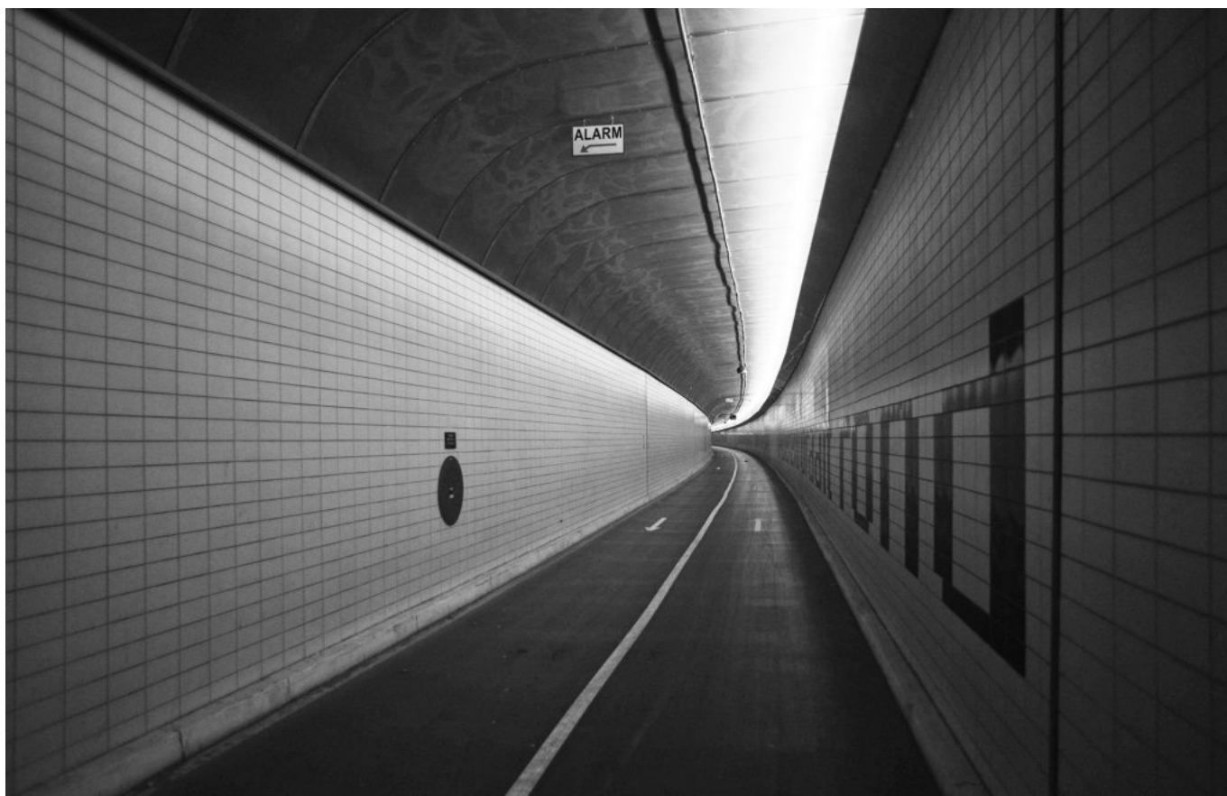
Cycling under the maas, Benelux Tunnel, Schiedam.