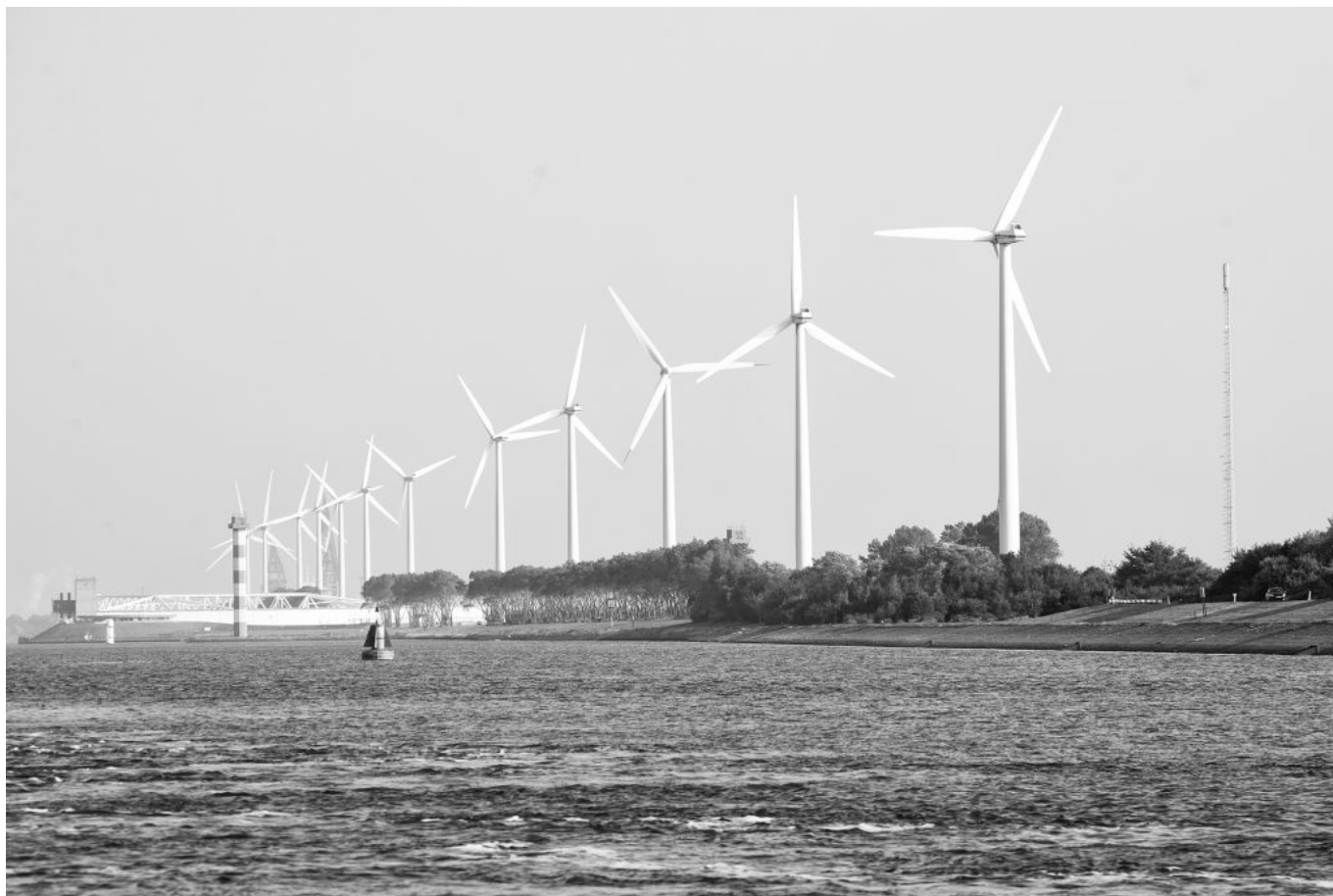
Linear Windfarm at Langtong.