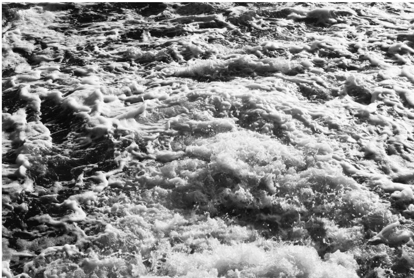
Water, Maasluis.