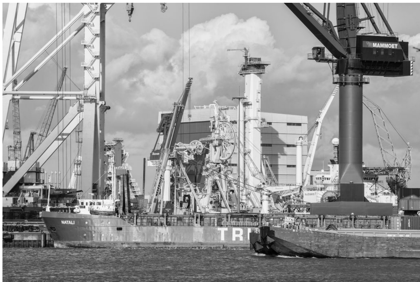
Wiltonhaven, view from the south bank of Neue Maas, Vijfsluizen – Schiedam.