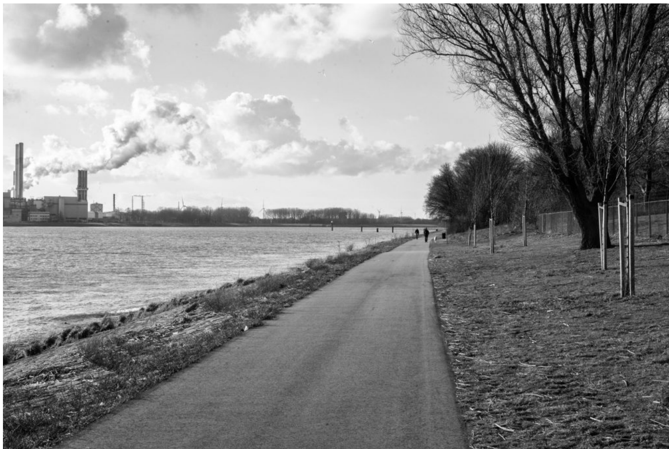
Maas promenade, Vlaardigen.