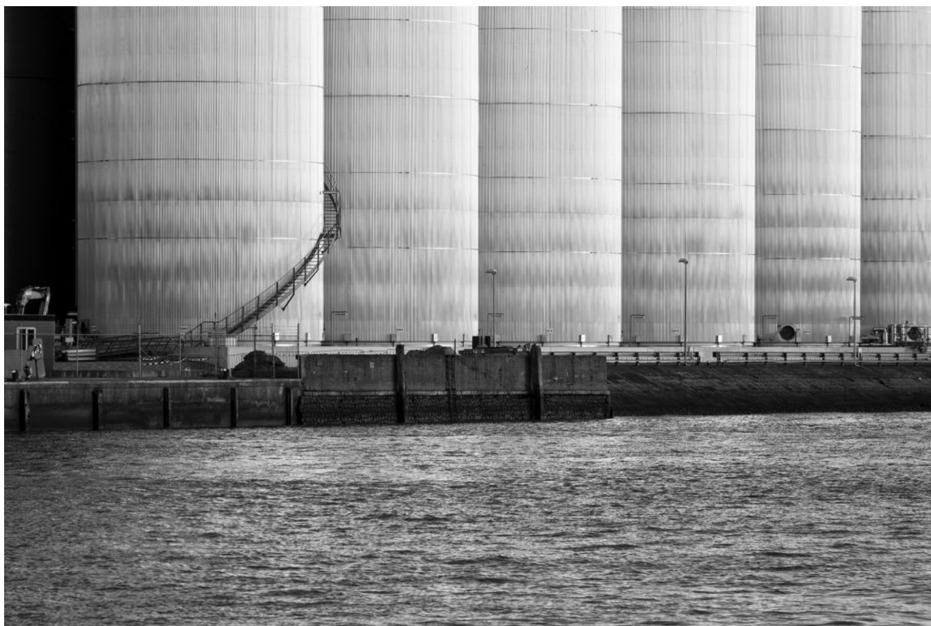
Vopak Terminal in Vlaardingen, Vlaardigen.