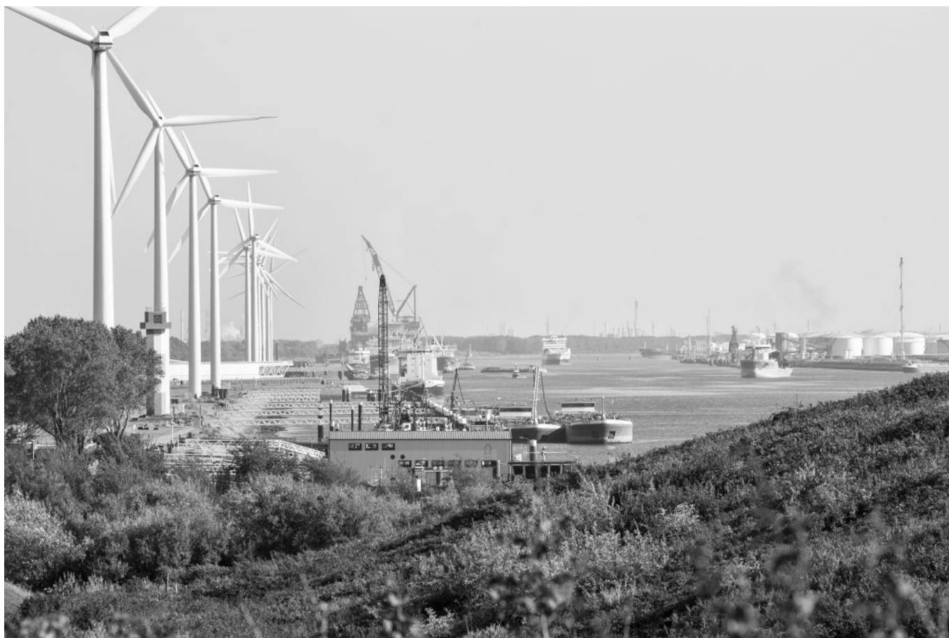
Landtong and Calandkanaal.