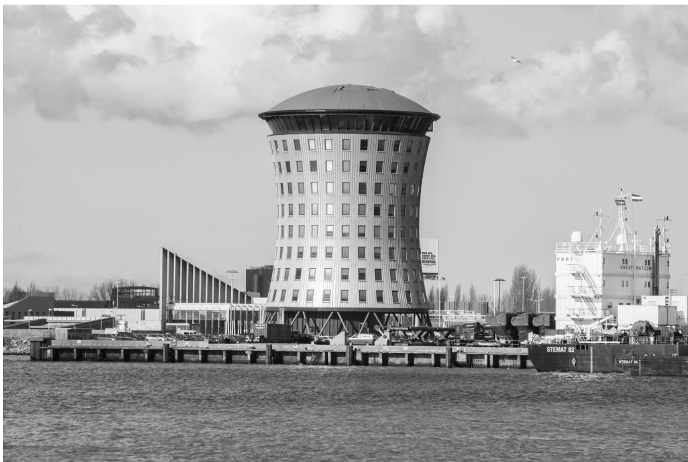
The Iconic “Mammoet” HD at Wiltonhaven, Schiedam.