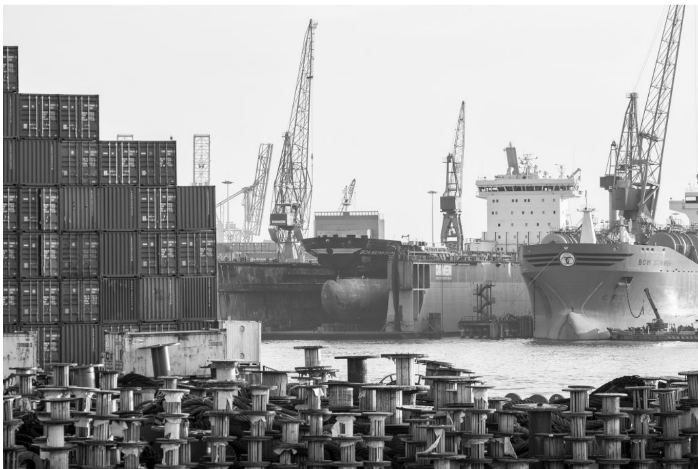
Container deposit, cable reels and ship repair at Eemhaven, Rotterdam.