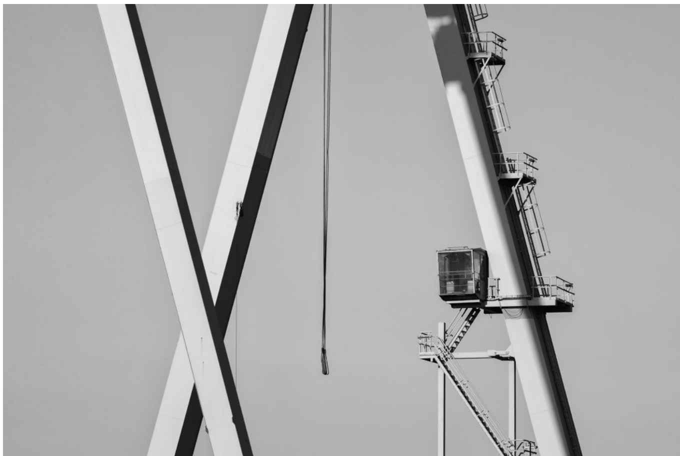
Cranes in Charlois Doklaan, Rotterdam.

municipalities that host and are crossed by the port could embody even more this identity of Port-territory and unfold this potential of industrial tourism.