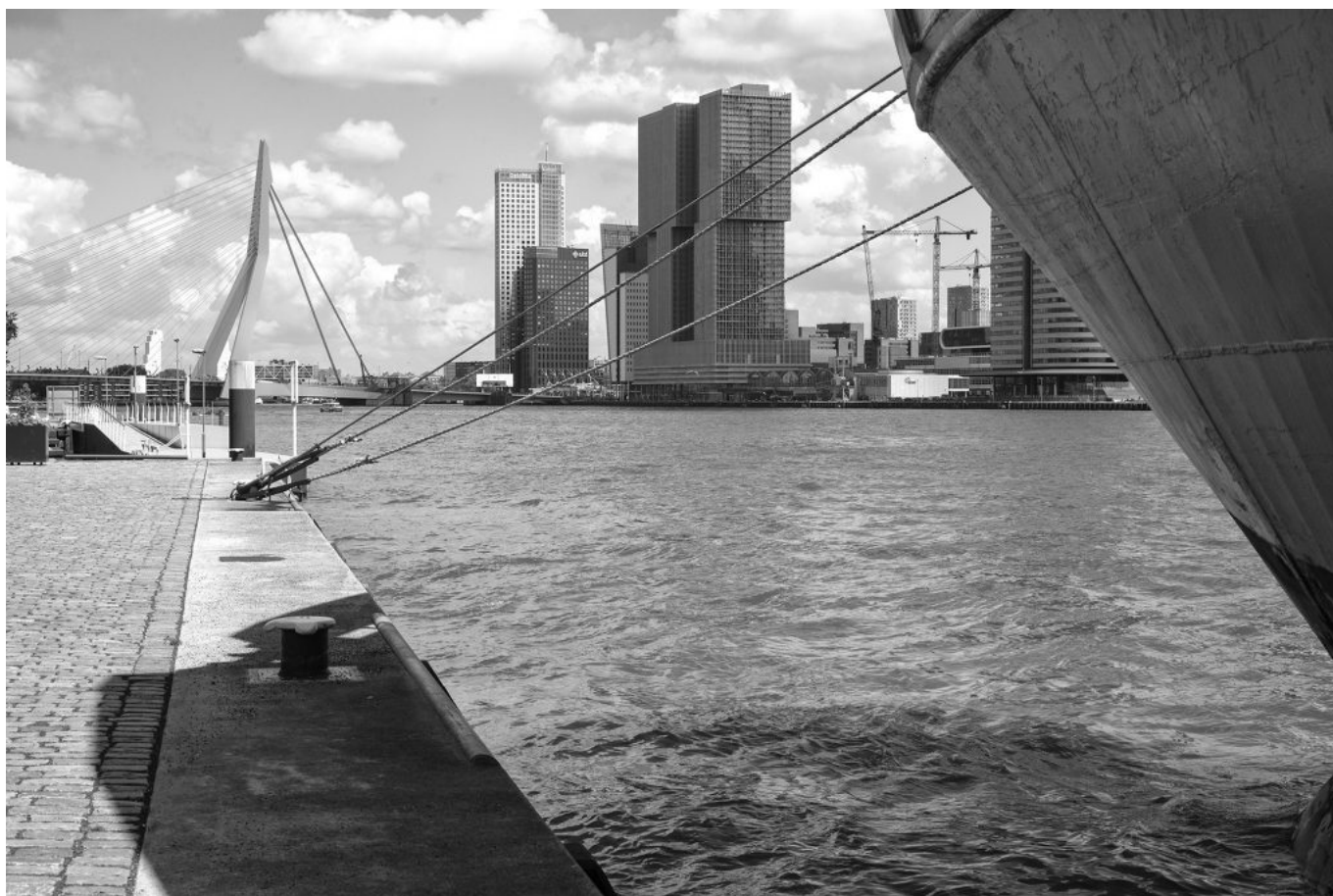
Docking in the center of Rotterdam, Parkkade – Rotterdam.