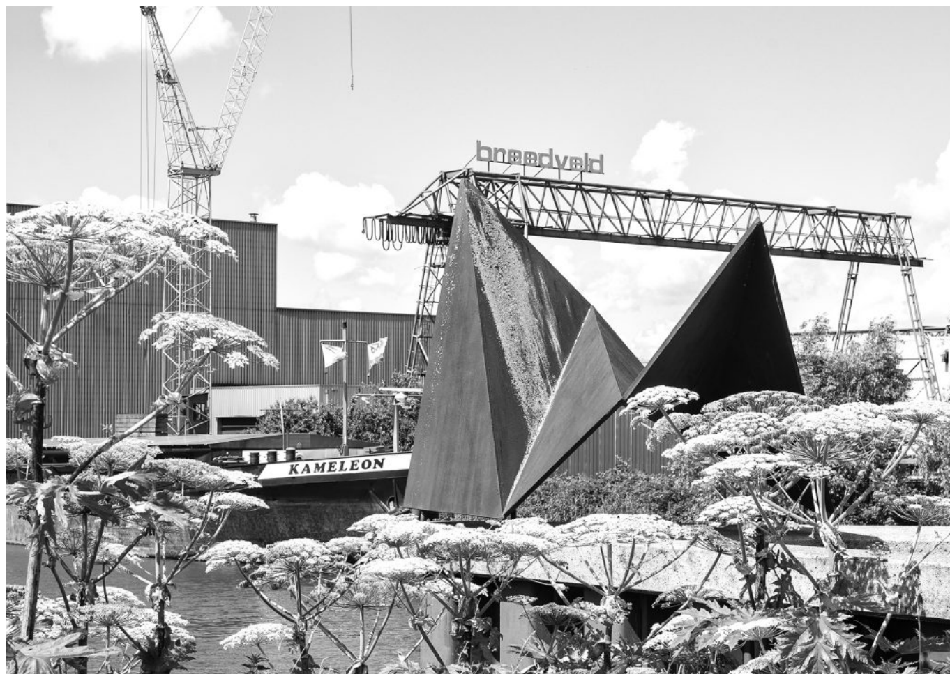
Sliksloothaven at Stormpolder, Rotterdam.