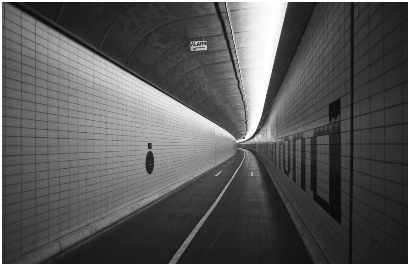
Cycling under the maas, Benelux Tunnel, Schiedam.