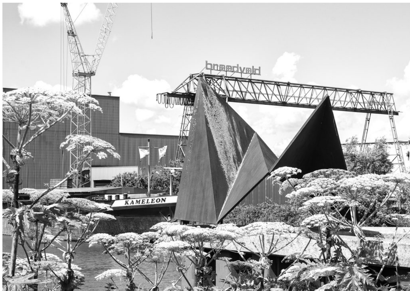
Sliksloothavem at Stormpolder, Rotterdam.