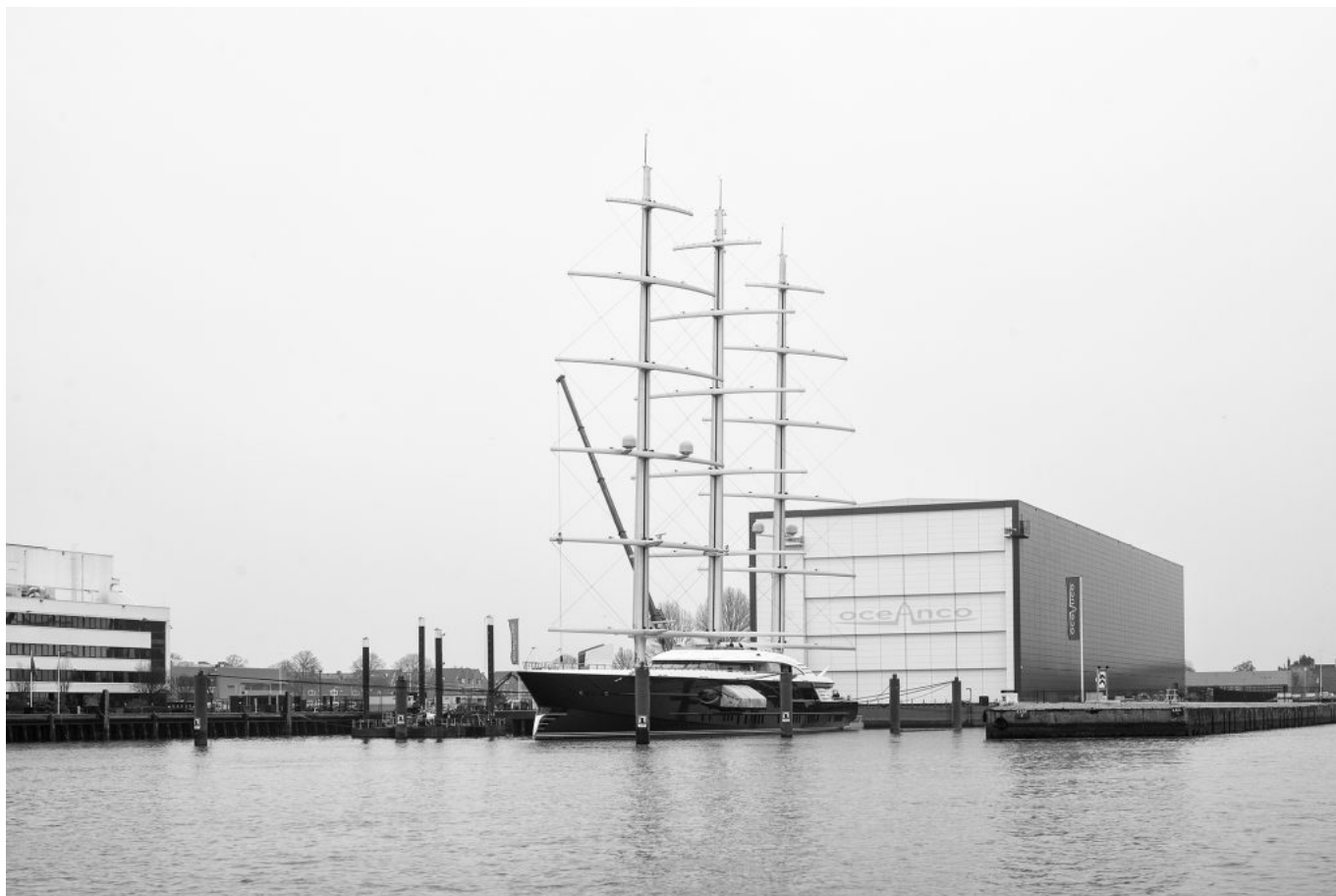
Shipyard in Marineweg, Alblasserdam.