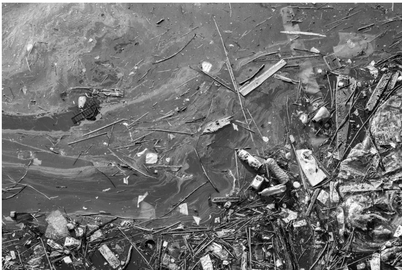
Water pollution at the Port of Rotterdam.