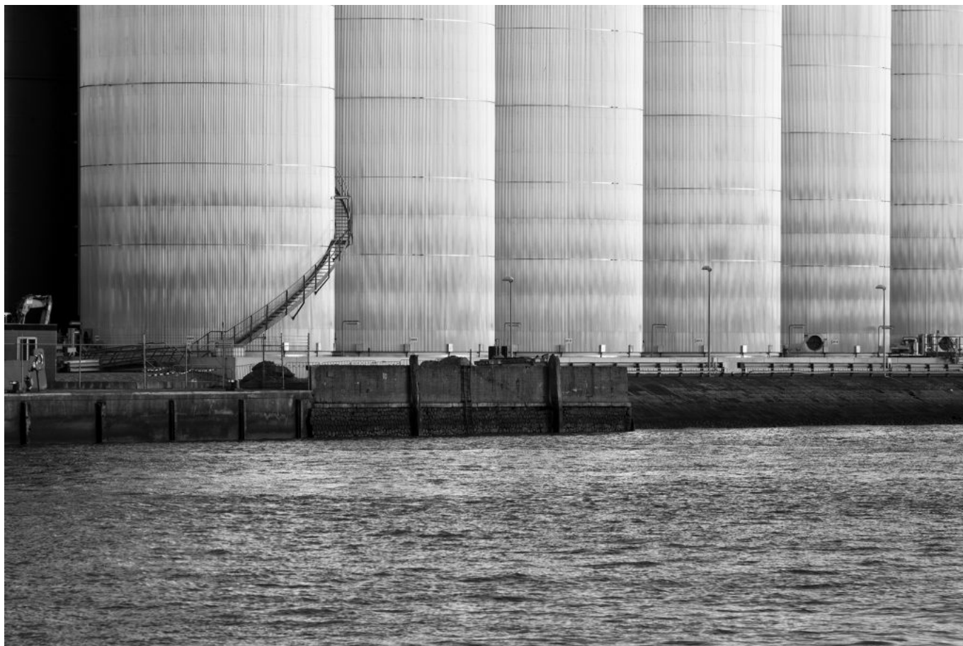
Vopak Terminal in Vlaardingen, Vlaardigen.