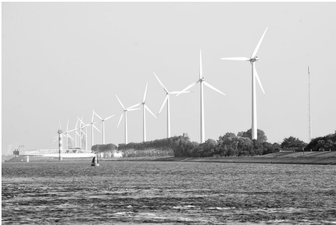
Linear Windfarm at Langtong.