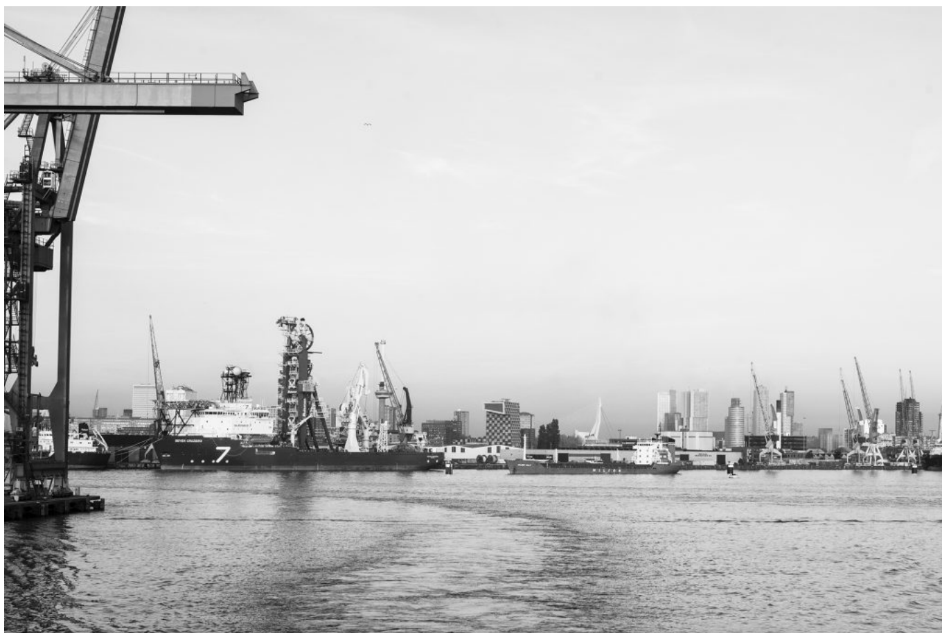
Rotterdam center skyline from Waalhaven, Rotterdam.