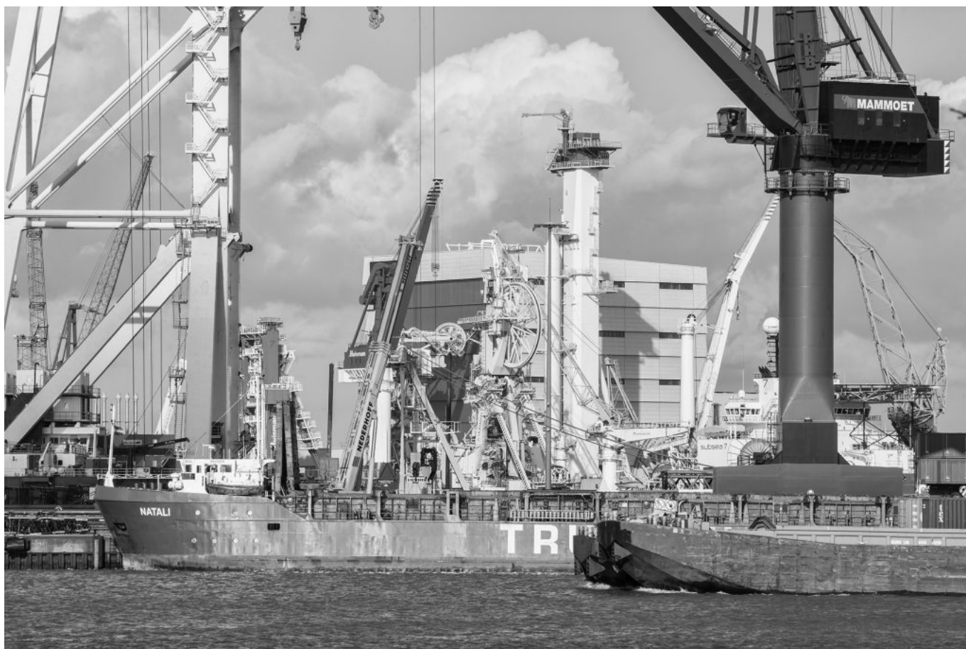
Wiltonhaven, view from the south bank of Nieuwe Maas, Vijfsluizen – Schiedam.