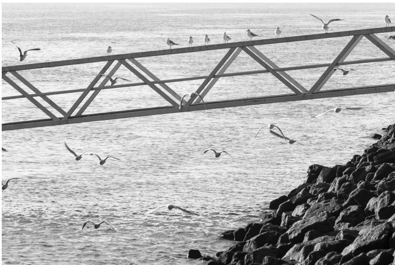
Water taxi pier ramp in the Maas.