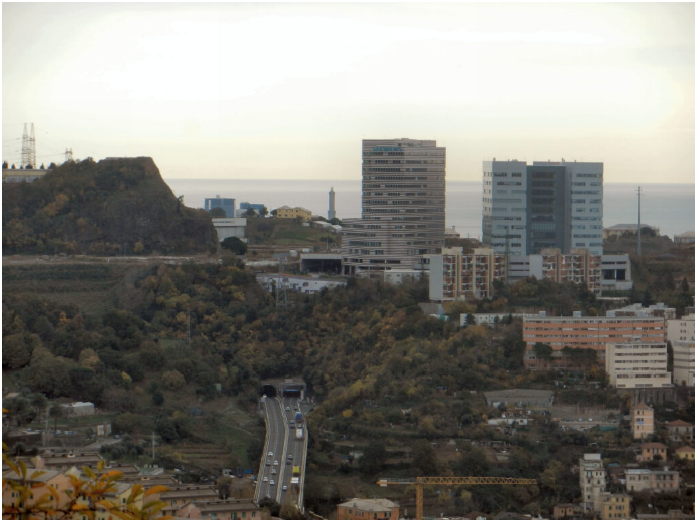
The Erzelli Science and Technology Park, first buildings completed.

The realization of the new Ligurian high-tech pole originates within the complex scenario of the globalization of economies, which has led the competition between the different urban realities to be a discriminating element for their economic development (Scott, 2008), tending to transform and reinvent themselves through the emergence of new epicenters. Last but not least, the role played by the public actor in the entire operation is fundamental: the State participates in the operation through Amco, a company belonging to the Ministry of Finance that recovered the shares sold by Banca Carige; the Liguria Region played a decisive role, deciding to locate the new hospital of the Ponente in the area; the University