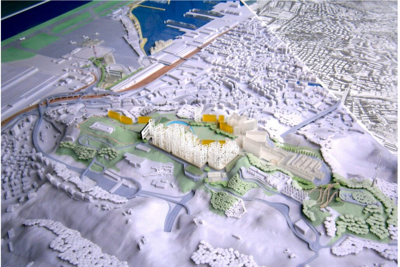
The Erzelli Science and Technology Park, physical model for public presentation.

The project has undergone several ups and downs over the years. Between 2008 and 2013, GHT invested around thirty million euros for the primary urbanization works, for the construction of the cogeneration plant, and for the construction of the first buildings. Ericsson, Siemens and the first companies and services settled in Erzelli from 2012. Esaote's settlement dates back to 2015. In 2016, the project for the first section of the park was approved and new companies, such as IIT, Alten, Enege and Liguria Digitale, arrived on site.