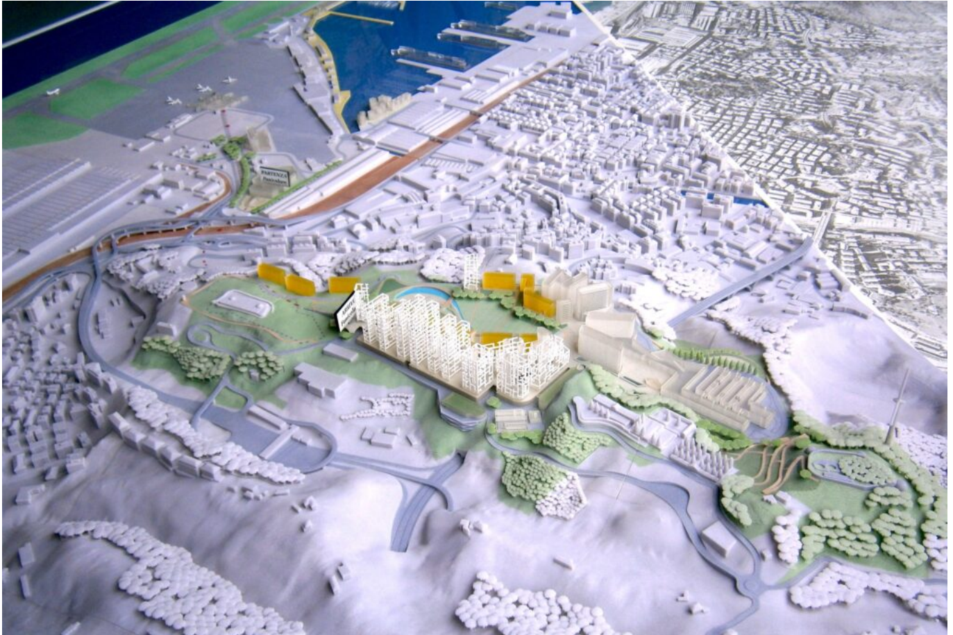
The Erzelli Science and Technology Park, physical model for public presentation.

The project has undergone several ups and downs over the years. Between 2008 and 2013, GHT invested around thirty million euros for the primary urbanization works, for the construction of the cogeneration plant, and for the construction of the first buildings. Ericsson, Siemens and the first companies and services settled in Erzelli from 2012. Esaote's settlement dates back to 2015. In 2016, the project for the first section of the park was approved and new companies, such as IIT, Alten, Enege and Liguria Digitale, arrived on site.