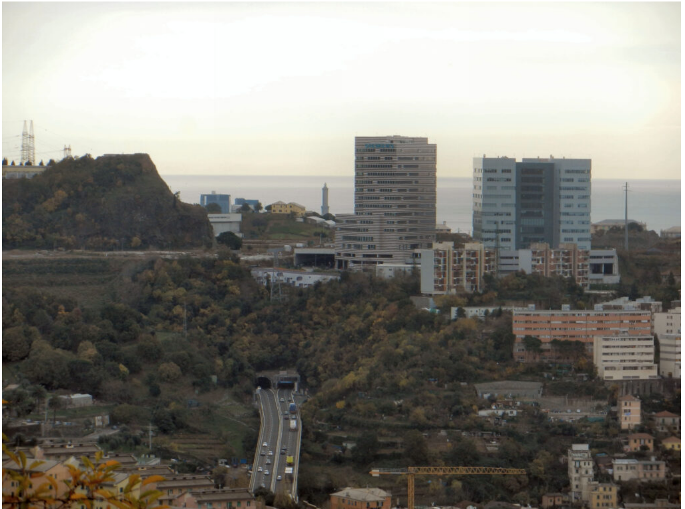
The Erzelli Science and Technology Park, first buildings completed. (Source: Wikimedia Commons, Creative Commons Attribution-Share Alike 3.0, 2014).

The realization of the new Ligurian high-tech pole originates within the complex scenario of the globalization of economies, which has led the competition between the different urban realities to be a discriminating element for their economic development (Scott, 2008), tending to transform and reinvent themselves through the emergence of new epicenters. Last but not least, the role played by the public actor in the entire operation is fundamental: the State participates in the operation through Amco, a company belonging to the Ministry of Finance that recovered the shares sold by Banca Carige; the Liguria Region played a decisive role, deciding to locate the new hospital of the Ponente in the area; the University