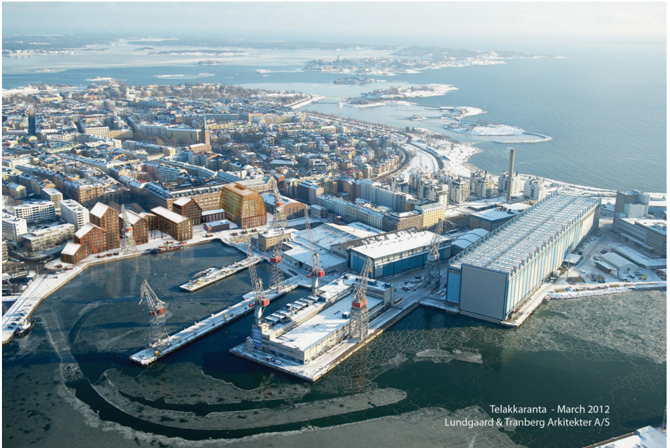
Telakkaranta - March 2012 Lundgaard & Tranberg Arkitekter A/S

Telakkaranta forms part of a still-functioning dock. The area has been vacated for new use. Some of the old industrial premises will be preserved, while residences, cultural premises and a hotel, among others, will be built in the district.