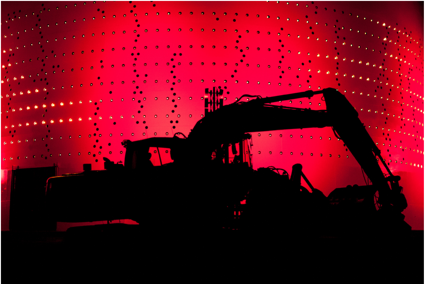
One of the oil reservoirs at Kruunuvuorenranta was preserved and converted into a work of light art, "Öljysäiliö 468" (Silo 468).

changing work of art. The inside of the reservoir can be used to house various events. This environmental art installation, titled Öljysäiliö 468 (Silo 468), refers to the oil harbour activities located in Kruunuvuorenranta for almost 90 years.