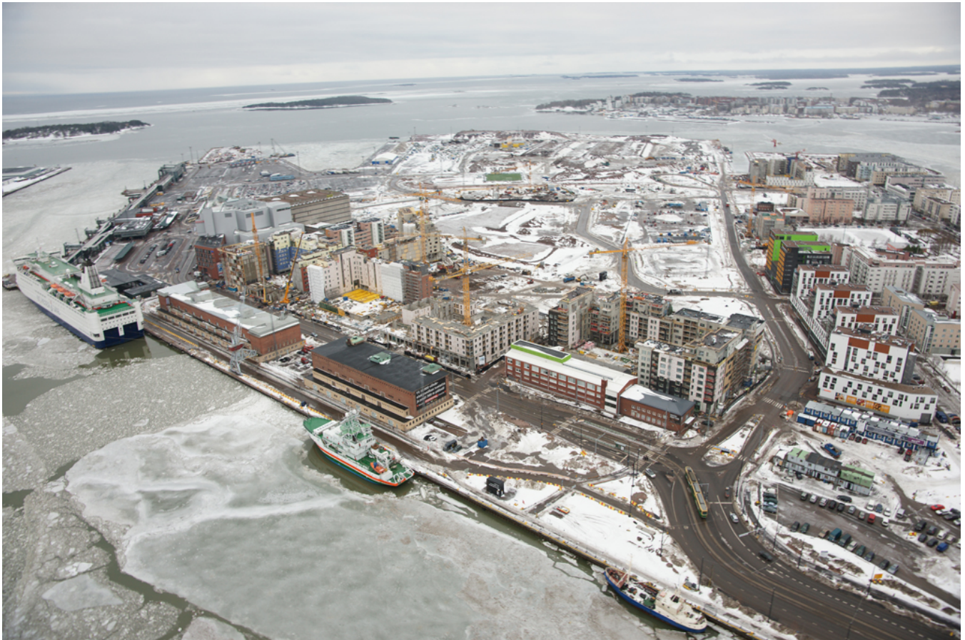
Jätkäsaari in January 2013. Construction has begun by the city centre.

The Jätkäsaari district mainly comprises landfill areas regained from the sea, built over former islands for the purposes of the cargo harbour. Further landfills have proceeded, resulting in an approximately 12-hectare expansion of the area. In addition, landfills will be used to raise the ground level in street areas and the central park area, by up to 5-8 metres.